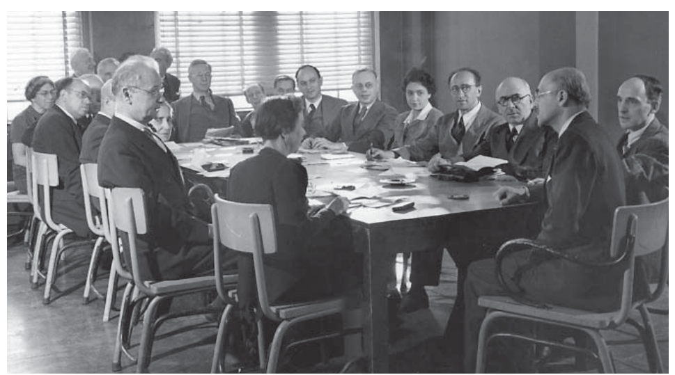
University in Exile, New York City, ca. 1934.

On Thursday, October 12, the University Libraries will present "University in Exile, 1933-1953: Refugee Scholars in New York, the New School for Social Research, and the German and Jewish Intellectual Émigré Collection." Led by a panel of distinguished scholars, the program will feature an overview of the widespread exile and escape of