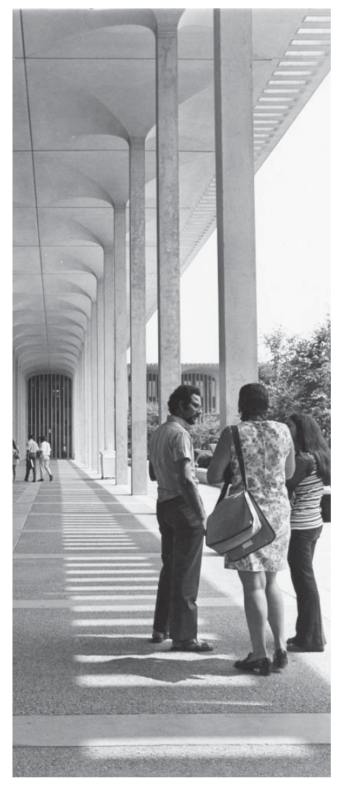
Archival photograph, uptown campus