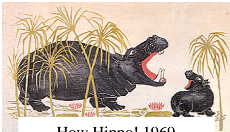
How Hippo! 1969

Thanks again for providing us with the support that enables the UA Libraries to excel.