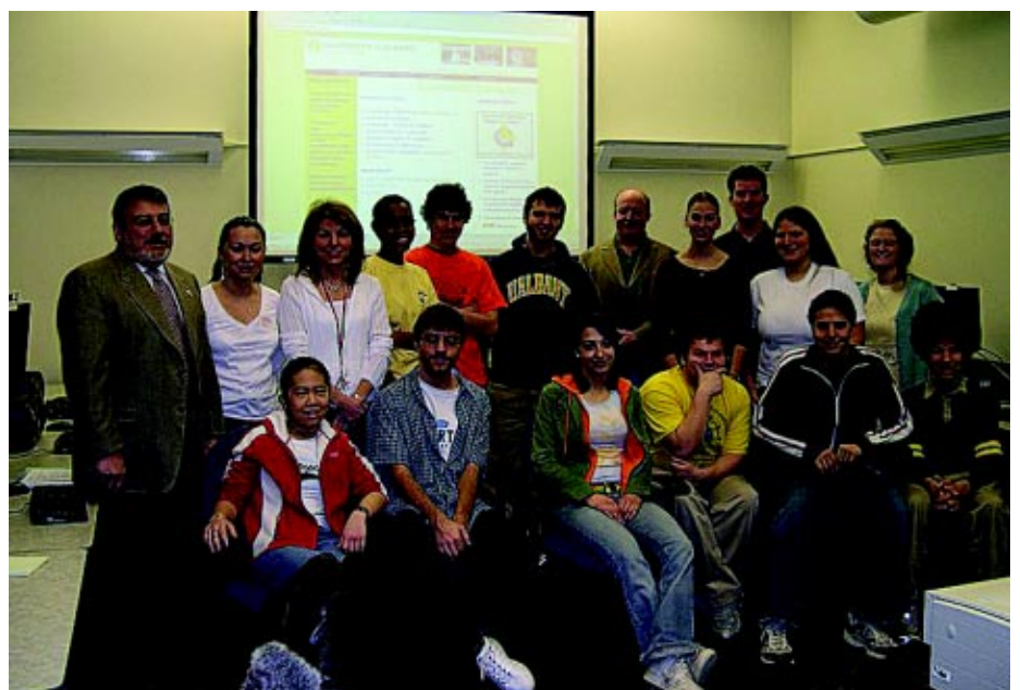
Students from Albany High School International Baccalaureate Program tour the University Library in March 2006.